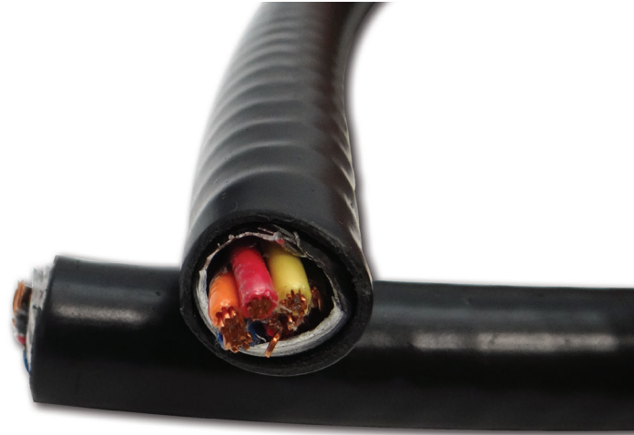
EZ IN Wire in the 14/7 wire configuration