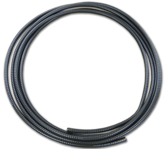
JMF provides an extra 6 feet of length on all EZ-IN Wire orders for ease of installation.

Additional wire sizes are available through special order.